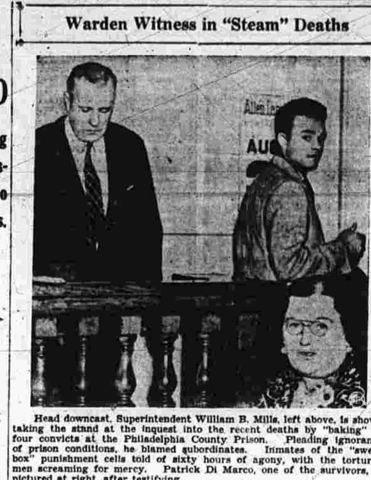
Warden Witness in "Steam" Deaths

Washington, Sept. 2.—(AP)—The War Department announced today that Major General Fox Conner, commander of the First Army and commander of the First Army and commander of the First Army and commander of the First Army.